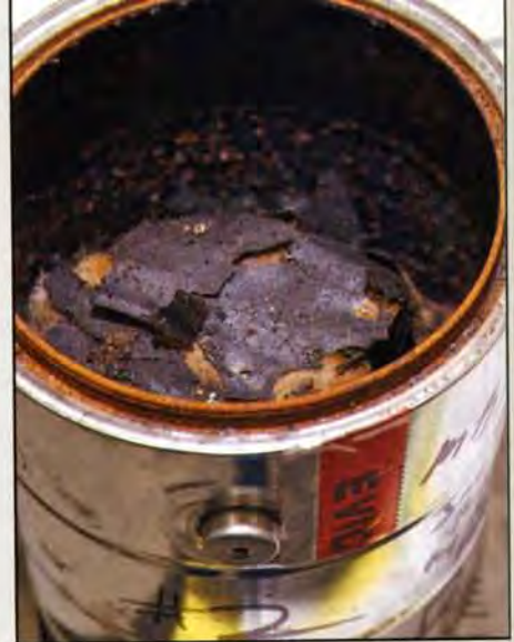
Above: Fire debris evidence collected in a metal can awaits analysis. Below: An examination under the stereomicroscope of a cotton swab for human hair.

Cost: $199 Available for college credit...ask us how! GET 10% OFF NOW WHEN YOU CALL THE NUMBER BELOW WITH THIS CODE: AAM092007 to order, call: (317) 844-0381